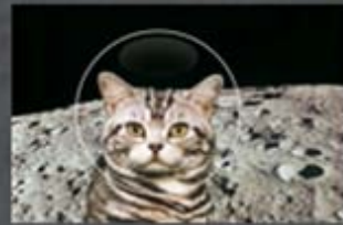
1 ASTRO CAT