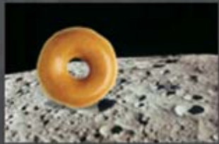
1 BIG DOUGHNUT