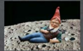
1 MAGIC GNOME