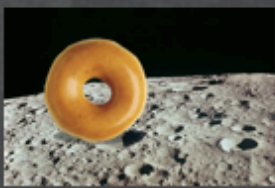
1 BIG DOUGHNUT