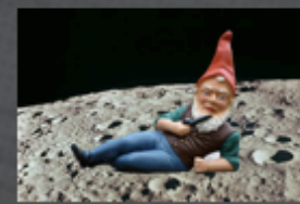
1 MAGIC GNOME